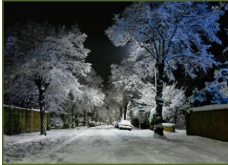
St Margaret's Road in Snow (Jan 2010)

For those who haven't yet seen them, and as a reminder to those who have, here are the new cards (with envelopes) for this year: we have two attractive local scenes, each with current Oxford connections and over-printed with the greeting 'With best wishes for Christmas and the New Year'.